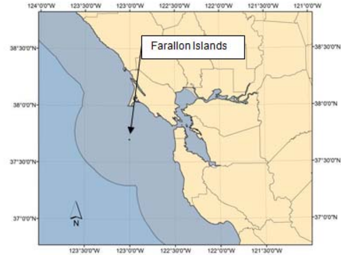
Figure 1b. Bay Area Detail